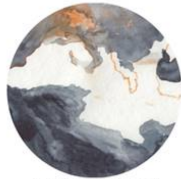
© Sinila Ili (projekt Bojan Djordjevic/Sinila Ili)